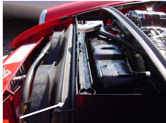
Bracket's keep condenser off of the radiator