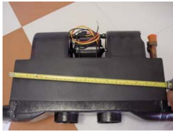
16 inches wide