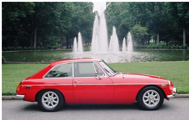
Air Condition Installation By: Gerald Medford

Why would anyone want to install an air conditioning system in a LBC? My answer would have to be.... The challenge of taking an aftermarket product and installing it into an LBC to make it look like a factory installed option and to make my co-pilot more comfortable. My co-pilots comfort probably has more to do with it than anything. After all guys that's what we are here for isn't it? I guess that could be debatable but life is so much better when they are happy. Oh Yea! When they are happy everybody is happy.