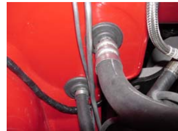
Hoses through bulkhead

The condenser that came with the kit didn't fit my radiator like I wanted so I searched the internet and found one from Vintage Air www.vintageair.com . I made a bracket to bolt the condenser and fan assembly to the front of my radiator. I found a 10 inch 2 fan assembly at Summit Racing www.summitracing.com that was a perfect fit. There was just enough room to tuck the fan and condenser just in front of the oil cooler.