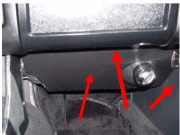
Evaporator cover Fuse panel (arrow)

I used a Moss ABS dash liner #453-863 to cover the evaporator mounted below the right glove box. I routed my a/c duct hose through this liner and routed the other behind my dash mounted CD player and installed another vent to the driver's side. My a/c switches were mounted on the dash panel below the CD player. One is a fan switch the other controls the temperature. I just wanted to throw in a picture of my SB connector. It's so much trouble getting to the battery that is mounted behind the passenger seat in case you need to jump start another LBC. I mounted a SB connector under the hood and have another connector on the end of my jumper cables. This makes life so much better! Do LBC's ever need a jump start?