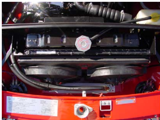
Fan assy. in front of condenser

The condenser that came with the kit didn't fit my radiator like I wanted so I searched the internet and found one from Vintage Air www.vintageair.com . I made a bracket to bolt the condenser and fan assembly to the front of my radiator. I found a 10 inch 2 fan assembly at Summit Racing www.summitracing.com that was a perfect fit. There was just enough room to tuck the fan and condenser just in front of the oil cooler.