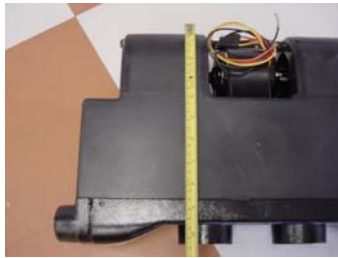
10 inches deep