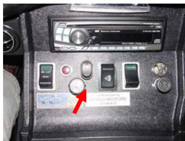
Lower left. Fan switch Lower right temp. Driver's side vent