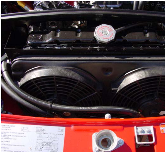
Dual 10 inch fan assembly