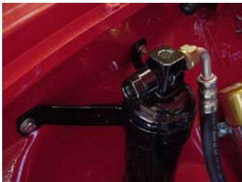
MG fuel pump bracket

Mounting the dryer was pretty simple. I used a fuel pump mounting bracket and installed it on the right side of the wheel well. The hoses went through the right side of the firewall and straight into the AC unit. I used rubber grommets to seal the hoses from the bulkhead.