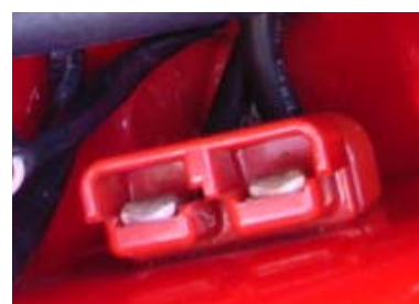
Handy-Dandy SB connector

Do you really need air on a LBC? No. Is it nice having that option? Oh Yes! Was the dollars and time spent worth it? I didn't think it was too much to spend for the comfort of having it available on these hot South Carolina summer days. The AC installation was the most fun part of my three year restoration on my GT. On a scale of 1 to 10, 10 being the most difficult, I would say this air condition installation project was an 8.