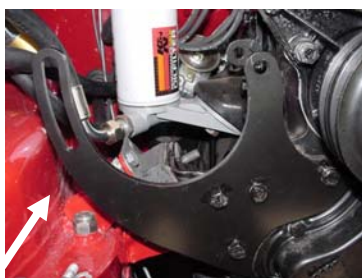
front mounting bracket

The challenging part is taking all these pieces and putting them into an LBC and making it look like it's a factory installation. You've heard the term "10 lbs. of potatoes in a 5 lb. sack". It can be done though. Mounting the compressor is probably the most complicated part of the installation and will vary from car to car. I mounted my compressor just above the right motor mount and used a blank adapter plate mounted to the front of the engine. ( see pictures below)