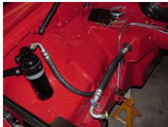
Dryer and hose arrangement