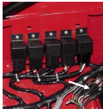
5 of 9 relays